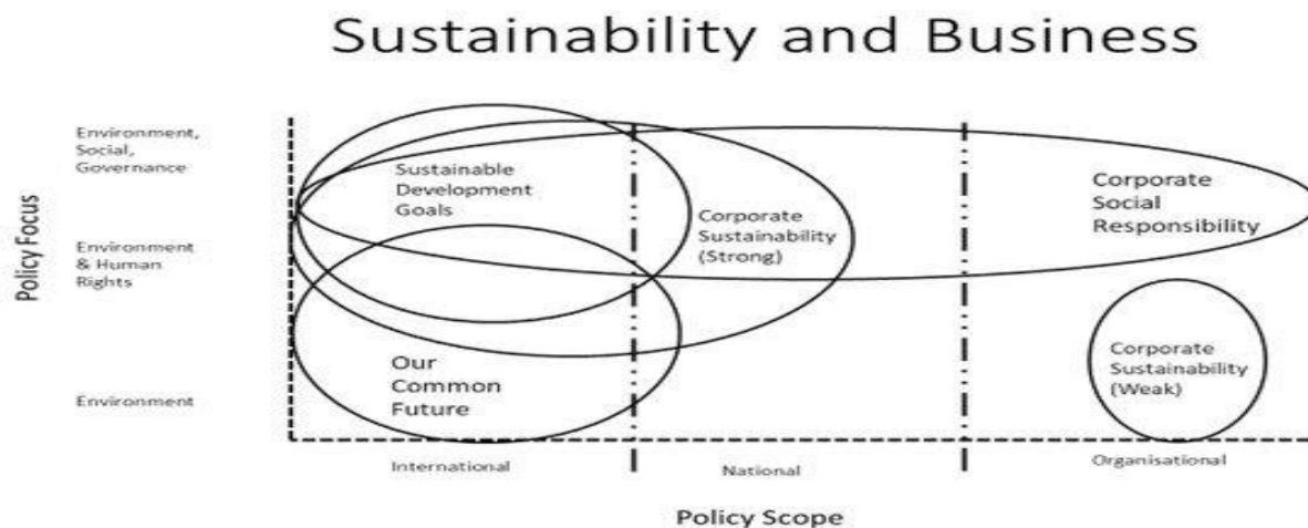
Figure 1: Sustainability and Business

globalization’s pressure, cost benefit analysis, competitive advantage, enhancing reputation, risk management, and stakeholders demands (Munir et al. 2018). A growing number of studies indicated that the significant effects of the CSR practices rely on the way the companies implement the CSR. Additionally, companies can increase the value of their shareholders and contribute to the firm’s sustainability through the strategic implementation of the CSR (Dubravská et al . 2020). According to Kelley's (1973) attribution theory, customers place a high value on CSR consistency because consumers focus on distinctiveness, consensus, and consistency when determining whether to attribute a behavior internally or externally.