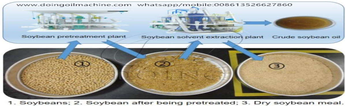
Fig.3 Process flow chart for extracting soybean oil using a solvent extraction method (23)

Solvent extraction is a commonly used method in commercial soybean oil production to separate the oil from the soybean meal. During the preparation process, the soybeans are flaked to create a large surface area for the solvent extraction process. In this process, a solvent (typically hexane) is pumped through the soybean flakes to dissolve the oil in the solvent, resulting in the separation of 99.5% of the oil from the meal. Following extraction, the hexane is recycled for future use (14). Soybeans are typically processed for solvent extraction using a machine like the Anderson Solvex™. This process is similar to preparing seeds for the Expeller by the Dox Extruder. However, the Solvex uses steam to cook the oilseeds instead of friction. The moisture inside the seeds expands due to a sudden pressure drop, creating soybean collets. These porous materials can be extracted more efficiently (11).