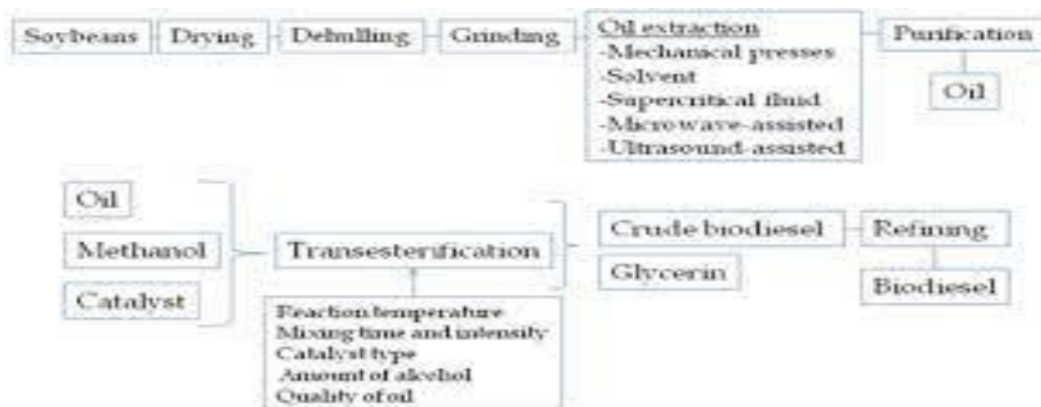
Fig.2 The process of extracting oil from soybeans to produce biodiesel (11).